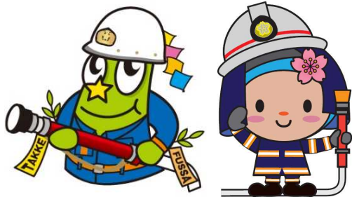
Fussa City Official Character TAKKE☆☆