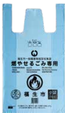
Types and price of designated collection bags (10 bags in a set)