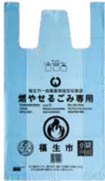
Types and price of designated collection bags (10 bags in a set)